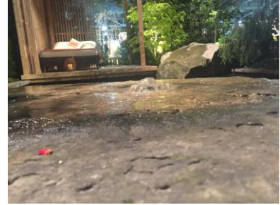
A low-key fountain in a boulder adds to the serenity of the Tranquility garden.

Co-located with the National Home Show, Canada Blooms takes place March 10 th to 19 th , 2017, at the Enercare Centre at Exhibition Place in Toronto. For more information or for tickets, please visit canadablooms.com . Follow Canada Blooms on Twitter @CanadaBlooms and Like it on Facebook .