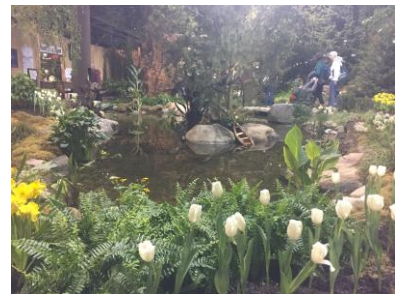
This pond is the central feature of the popular Secret Path garden.